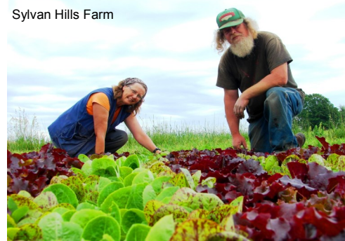
Sylvan Hills Farm

Connecting the community through agriculture