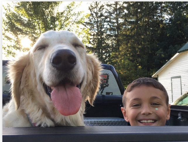
Holy Cuteness Batman! Willing Workers Sept. Mtg.

4 fun and free NYSD Computer Science Coding Challenges coming up this week! 8-14 year olds sign up here.