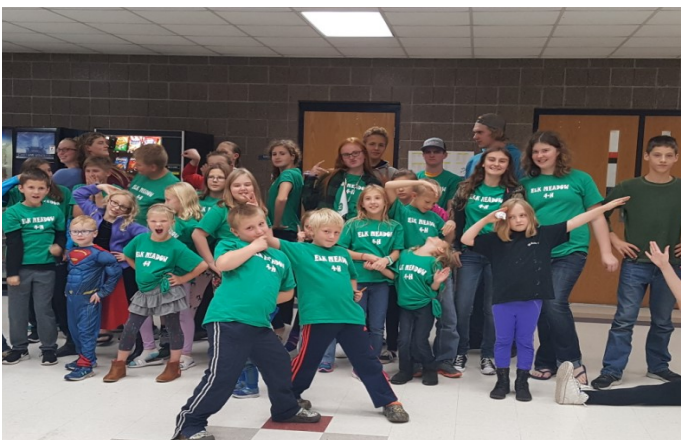
National 4-H Week included some serious shenanigans at Elk Meadow 4-H. This gang dressed up some windows to tell the world why we love 4-H so much and they won a $25 to use at the 4-H Store. Congrats!