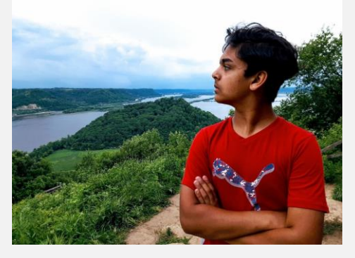
Winner of the "Every Picture Tells a Story" category, Dunn County 4-H 2020 photo contest.

Disclaimer: This data is from 2019. We wanted to capture 'traditional trends' as we experienced reduced numbers due to COVID-19