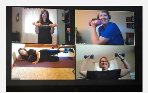
FoodWIse staff lead virtual statewide Strong Bodies program