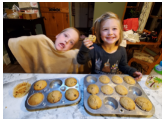
Two 4-H youth enjoying the product of their muffin making class.