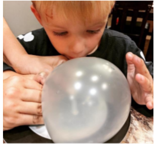
Young boy experimenting with 4-H polymer science blowing a slime bubble.