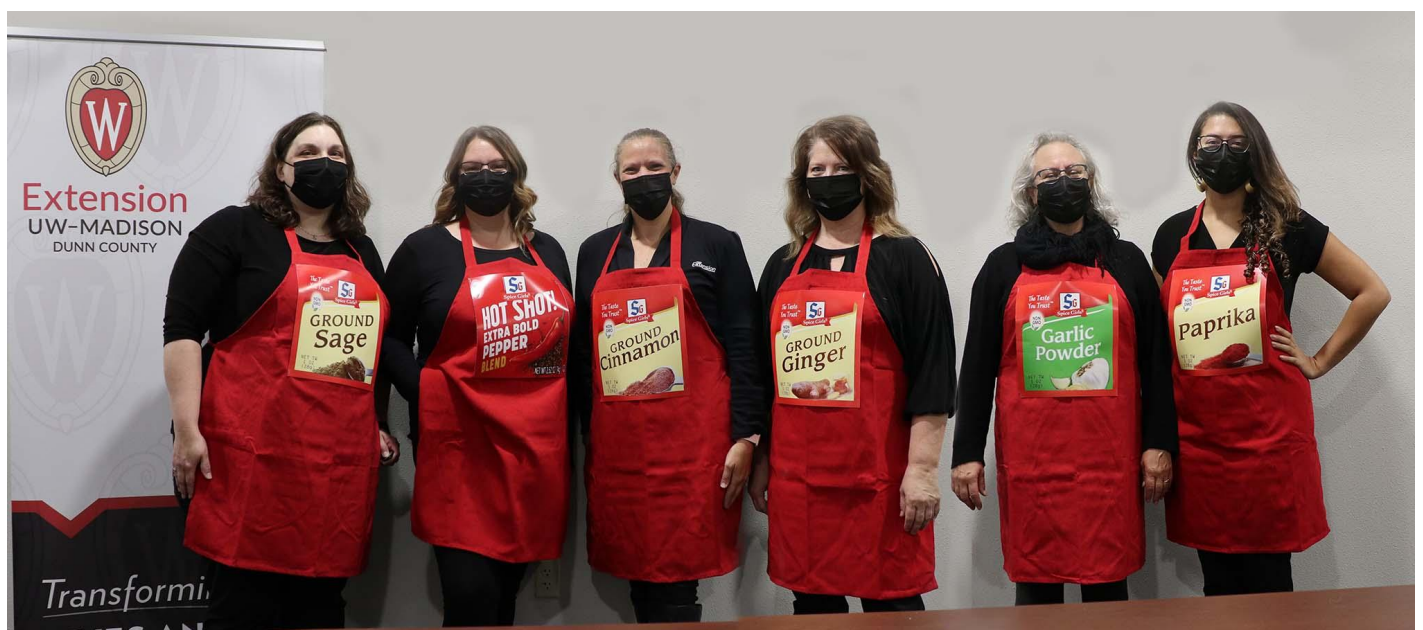
The Extension team participated in the Halloween costume contest with “The Spice Girls” costumes!

https://chancellor.wisc.edu/blog/some-personal-news/