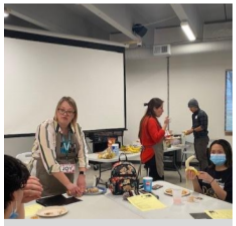
"I'm glad we are able to gather all the resources available to the community and to our teens in one place for them. Thanks again for everything you're doing!"

"This is our second year participating in an A.I.M. virtual art experience. I love how my children have learned new art techniques and ways to be creative. We wouldn't come up with these great art project ideas on our own, and Art U makes it easy with basic art supplies at home! Thank you!" -4-H Mom