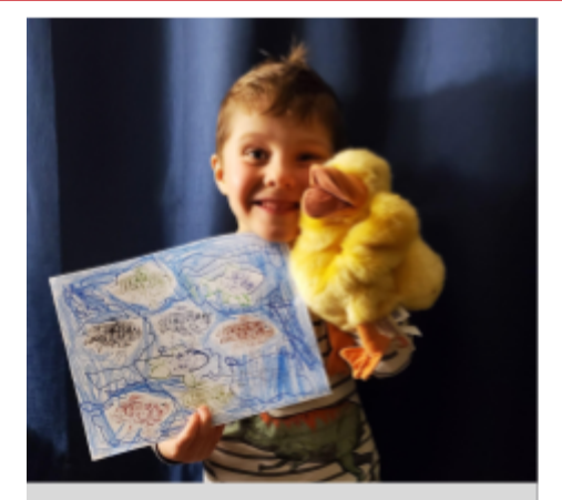
"Art is the best!" -4-H 1st Grader

scholarships from our 4-H Leaders Council. Speaking of awards, this month I found out I had been honored with a state-wide Extension professional organization's Individual Diversity Award. It will be presented at our state Joint Council of Extension Professionals conference in Stevens Point.