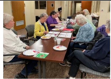
Playing Bingo and having snacks