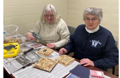
Making cork trivets