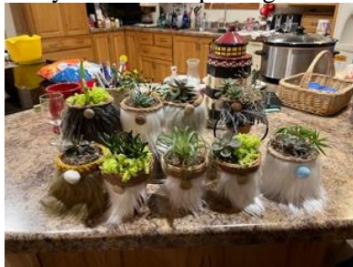
Our finished gnome projects