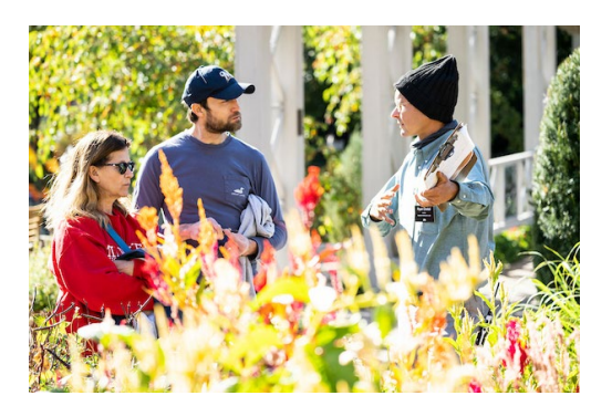
A horticulture educator talks with local property-owners.

Horticulture Diagnostic Inquiries totaled 314 for Home Gardeners in Chippewa, Dunn and Eau Claire Counties in 2022