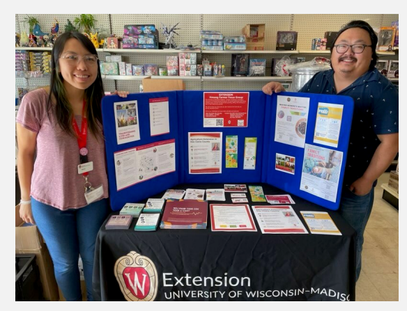
Educators stand by an informational board, which shares Extension resources and services for the community.

The program will tour a farm with a high tunnel, and discuss how the high tunnel is constructed, being used, challenges and issues, and how it has supported their farm business. It will further raise awareness of grants and other financial resources available to purchase a high tunnel. To additionally support the learning process, the program will be presented by a HMoob-speaking professional from the field.