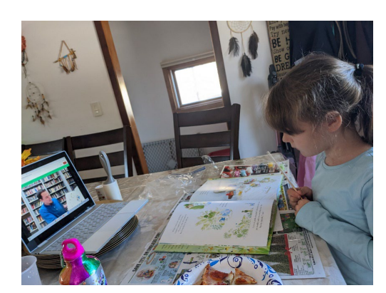
A grandmother sent us this picture of a child watching her father read to her via the Making Reading Memories program in the Dunn County Jail.

-Parent Participant in Making Reading Memories