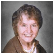
Beloved member of Ideal HCE for over 55 years.

Popple Creek-July we went to Klemish Dairy in New Auburn. We sampled several flavors of their ice cream made on the farm. There was no tour, we just purchased asst. flavors ice cream from their freezers at the farm.