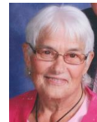
Active member of Elk Meadow Club for over 40 years.