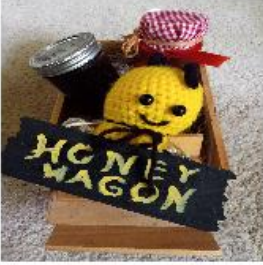
Constructed Original Item

Friday, August 2, 12:30 pm to 3:30 pm Government Services Building, Room 60